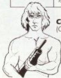
Corporal Lance (Code name: Scorpion)