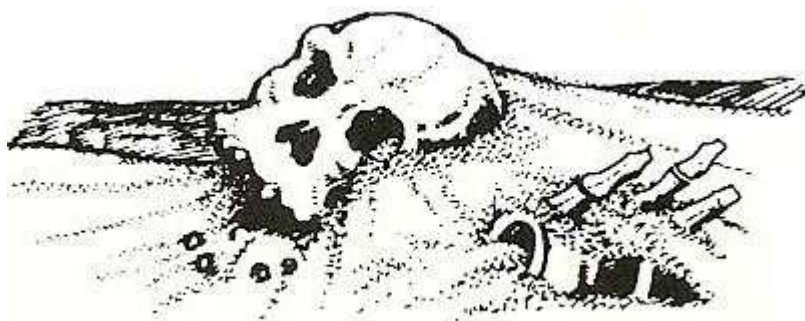
Illustrations on Instruction Sheet by Bill Houston.

Copyright subsists on the program. All rights of the producer reserved. Unauthorised broadcasting, diffusion, public performance, copying or re-recording, hiring, leasing, renting and selling under any exchange or repurchase scheme in any manner is prohibited.