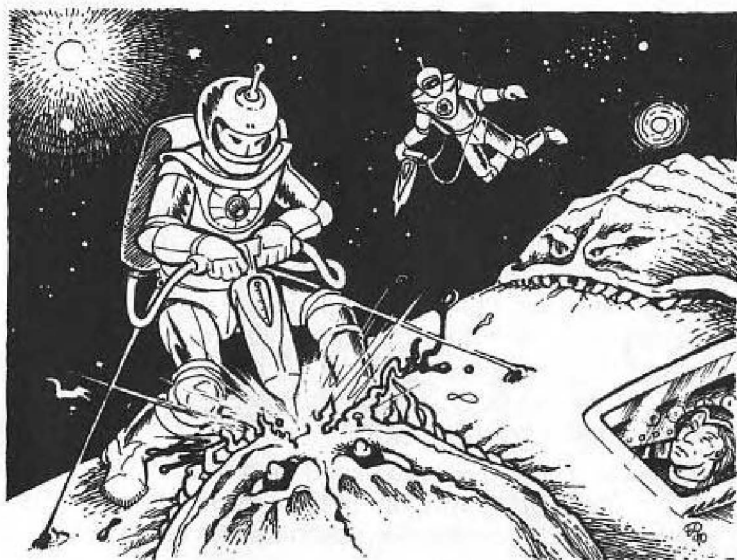
"Removing VUX Limpets After a Battle"

Nonetheless, the Discriminator is fast and agile, a characteristic which led one Earthling crew to nickname the craft the "space jitterbug." Discriminators dodge most enemy weapons.