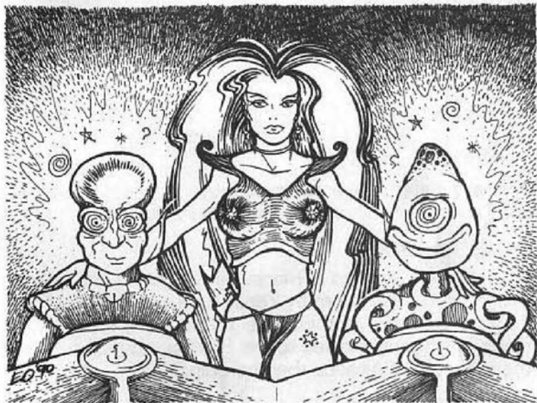
"Syreen with Hypnotized Crew"