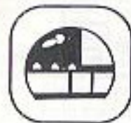
LIFE FORCE GENERATOR

You are the captain of a metamorphic Star Ship. Loaded with power and determination, you slice through enemy formations. Every time the Star Ship sustains any damage, it will transform into a different ship. Be careful though, for your Star Ship will explode when its metamorphic capabilities run out.