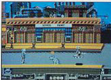
Radiant Dog takes on Dr. Mayhem's Minions

As your team battles to save Dynatron City, Dr. Mayhem is busy churning out more and more synthetic creatures to keep you hopping.