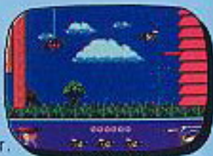
A TANGLED WEB

Who'd have thought that the success of major preserve distributor "Really Nice Honey" depended almost exclusively on one worker. Not a white or blue collar worker but a black and yellow-striped worker-you! A series of mishaps have befallen your co-workers and now it's up to you to ensure the continuing success of "Really Nice Honey".