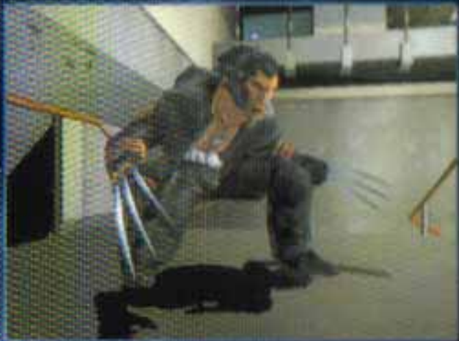
Use your razor-sharp claws to slice and dice opponents at will.