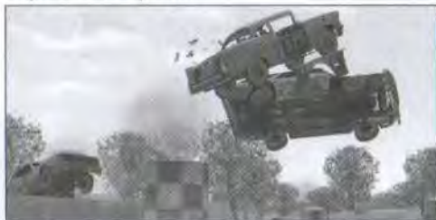
Figure-8 Jump Race

This race is set on a figure-8 track with crossing jumps in the center. It is one of the most dangerous and outrageously fun events in the game.