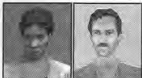
Diaz Bros: Enter the bloodbath