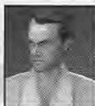
Sosa: I told you never to mess with me, Tony!