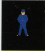
SGT. JEFFERSON - The Police Sergeant in charge of law and order in sleepy Tynham Cross.