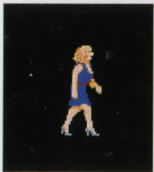
MRS JONES, wife of Mr. Jones - Landlady of the "Dog and Duck"

THE LIVES AND MOVEMENTS OF ALL THESE CHARACTERS WILL HELP YOU TO UNRAVEL THE MYSTERY OF TYNHAM CROSS