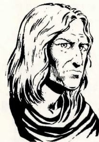
from "Dragons of Hope"

So weak when he was born that he wasn't expected to live, Raistlin survived through his sister's efforts and the protection of his twin brother Caramon. Just before their fifth birthday, the twins were taken to a fair where a conjurer performed tricks and illusions. Caramon watched for a while and wandered off, but Raistlin stayed all day and then astonished his family by reproducing every trick he'd seen.