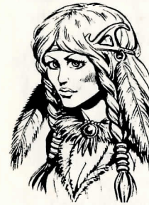
from "Dragons of Hope"

Daughter of the chieftain of the Que-Shu tribe, Goldmoon's future seemed to be set from birth; whomever she married would become chief of the Que-Shu. Unknown to everyone, the gods had different plans for her. The first sign of these plans came when Goldmoon fell in love with Riverwind rather than any of the other more suitable young men.