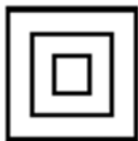
The Black Hole