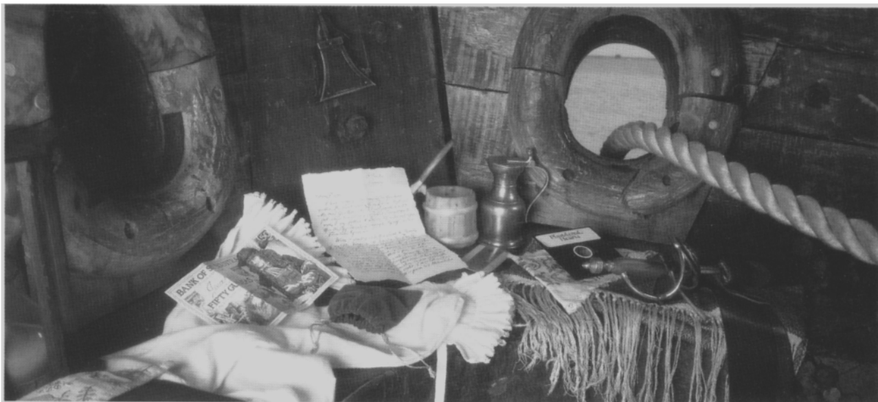
Buried inside every PLUNDERED HEARTS package: your PLUNDERED HEARTS disk, and an elegant velvet reticule containing a 50 guinea note and a letter from Jean Lafond.

In the 17th century, the seas are as wild as the untamed heart of a young woman. But when you set out on the schooner Lafond Deux , bound for the West Indies, your thoughts are only of your ailing father who awaits your care. Little do you know that your innocent journey will soon turn to dangerous adventure.