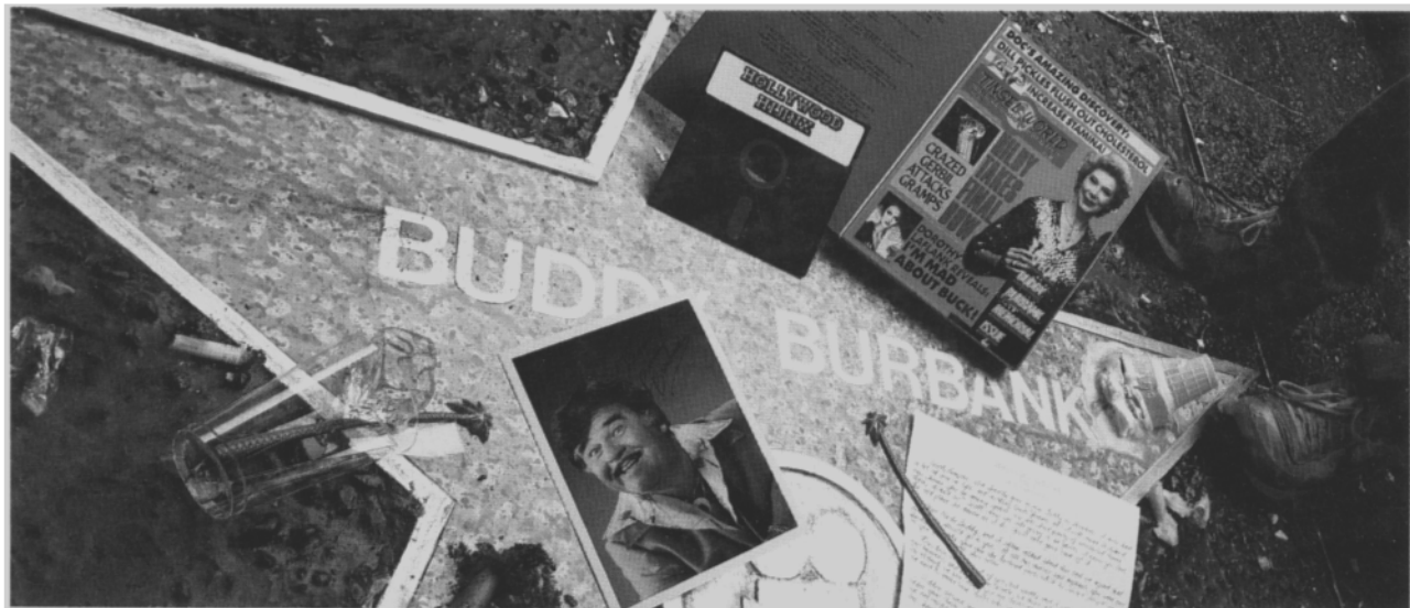
Featured in every package of HOLLYWOOD HIJINX: your HOLLYWOOD HIJINX disk; a star-studded copy of TINSELWORLD magazine; your Aunt Hildegard's will; an autographed photo of your Uncle Buddy; and a lucky palm tree swizzle stick.

Vampire Penguins. A Corpse Line. Meltdown on Elm Street. Who could forget these classic Hollywood movies produced by your uncle, Buddy Burbank? But his greatest masterpiece has yet to be experienced... HOLLYWOOD HIJINX, starring you!