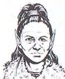
By Larry Elmore, from "Dragons of Hope"

Most people not only don't understand Kender but don't want to know them. This is often due to their basic personality traits: fearlessness, unbelievable curiosity, irresistible mobility, independence and the need to pick up anything not screwed down (unless they have a screwdriver, in which case...)