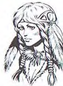
from "Dragons of Hope"

Daughter of the chieftain of the Que-Shu tribe, Goldmoon's future seemed to be set from birth; whomever she married would become chief of the Que-Shu. Unknown to everyone, the gods had different plans for her. The first sign of these plans came when Goldmoon fell in love with Riverwind rather than any of the other more suitable young men.