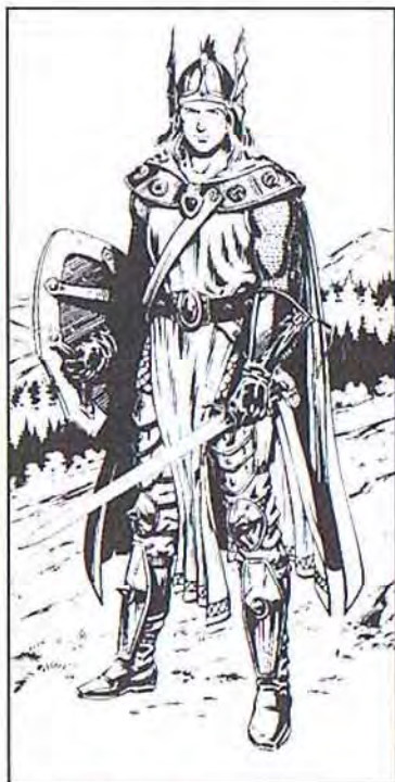
By Larry Elmore, from "Dragons of Mystery"

Ring mail armor; Longsword (damage 1-8); Spear (damage 1-6).