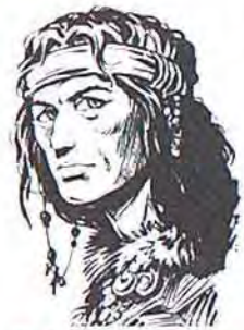
By Larry Elmore, from "Dragons of Hope"

Born into a family of virtual tribal outcasts, no-one in the Que-Shu tribe had a lower social position. His family refused to believe in the divinity of the tribal chieftain and were the last believers in the old gods. Tolerated for his skills, Riverwind would probably have been left alone to live his life had he not asked permission of the tribal chief to marry Goldmoon.