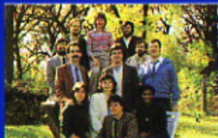
Adapted by The Game Weavers.