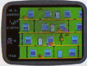
THE PIPE MANEUVER