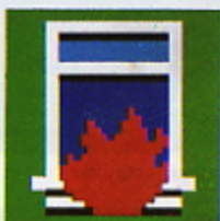
LARGE WINDOW FIRE