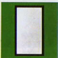
THE SECRET DOOR