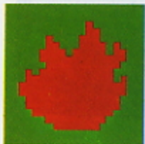
RED FIRE PARTICLE