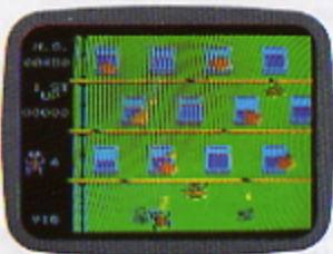
THE SECRET DOOR