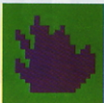
MAGENTA FIRE PARTICLE