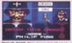
PHILIP FUSE —This terrorist throws bombs at police along Highway 30.