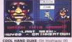
COOL HAND DUKE —On highway 50 you may run into Dragnettown's all-around bad guy.