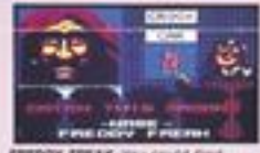
FREDDY FREAK —You could find this Dope Peddler on Highway 10.

Here are 4 of the 15 grungy gangsters roaming the streets in A.P.B.