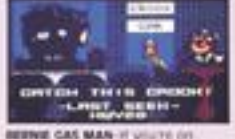
BERNIE GAS MAN —If you're on highway 20 you could meet this city arsonist.

As officer Bob gains experience, he will see All Points Bulletins (A.P.B.). An A.P.B. calls for the arrest of a major criminal. Capturing one of the criminals and running him or her into the station will satisfy the daily quota. To capture an A.P.B., Officer Bob must ram the offender's car several times with the siren on. The most dangerous crooks must be rammed many times before they will give up. Violators include the following: