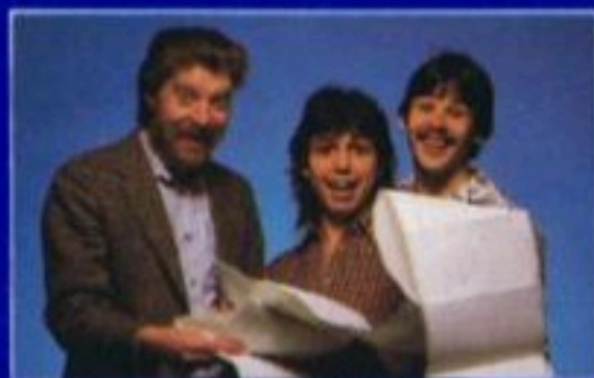
Adapted by Beck-Tech.